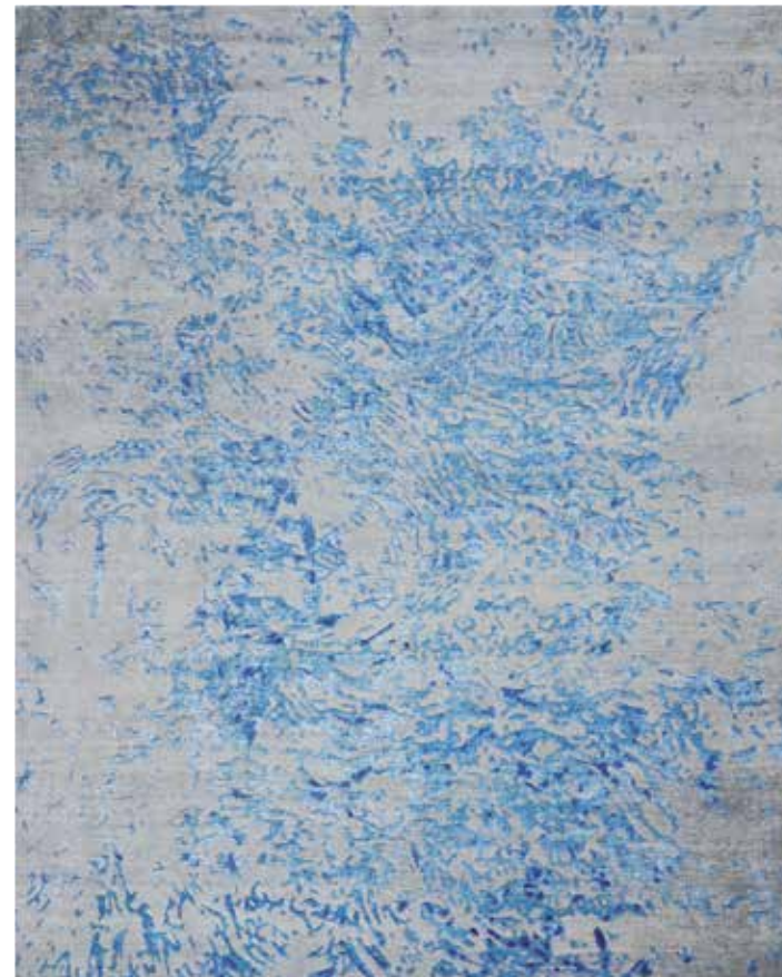
SHA18 GREY BLUE