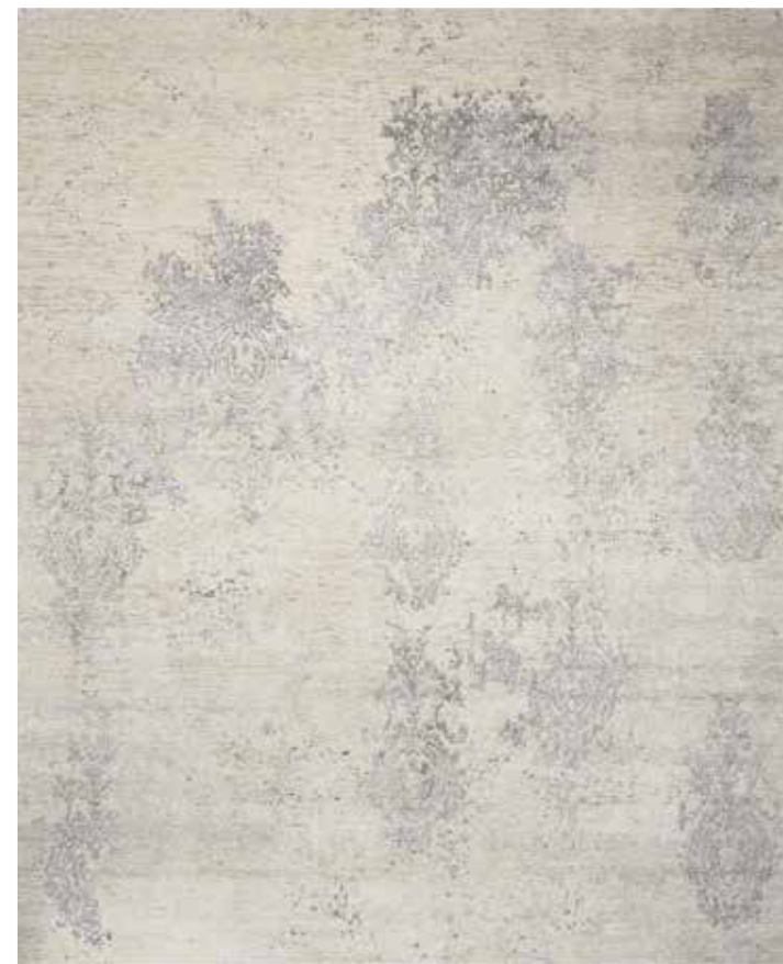
SHA14 IVORY SILVER