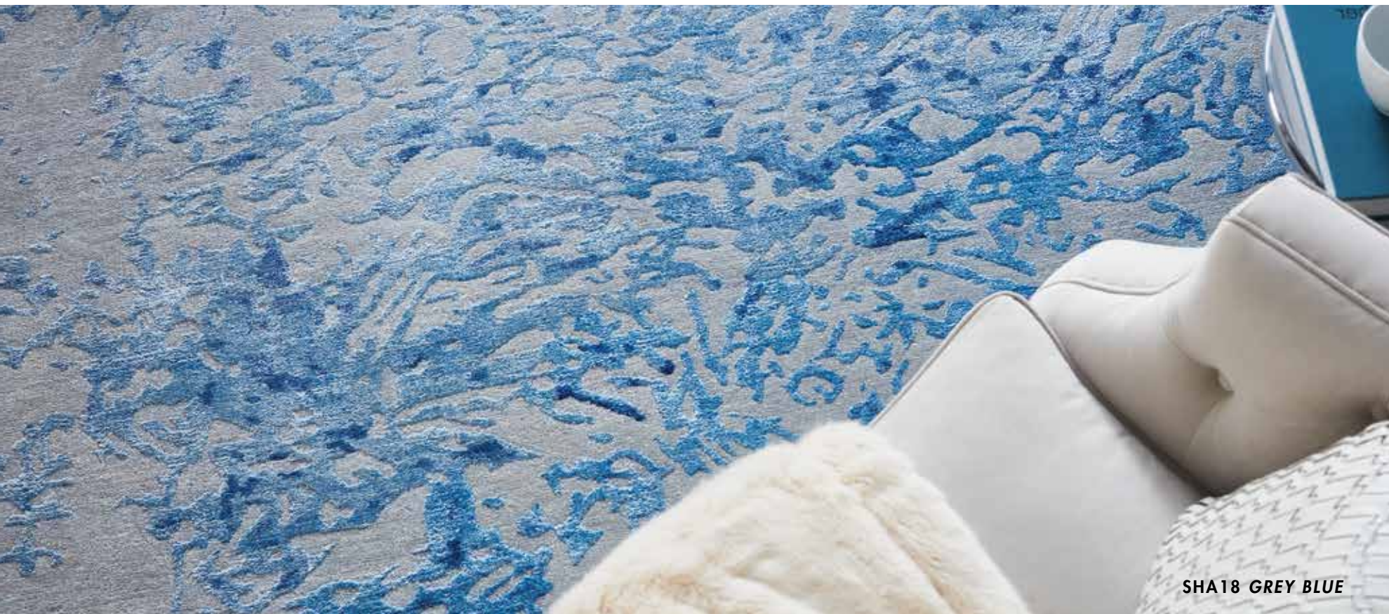
SHA18 GREY BLUE