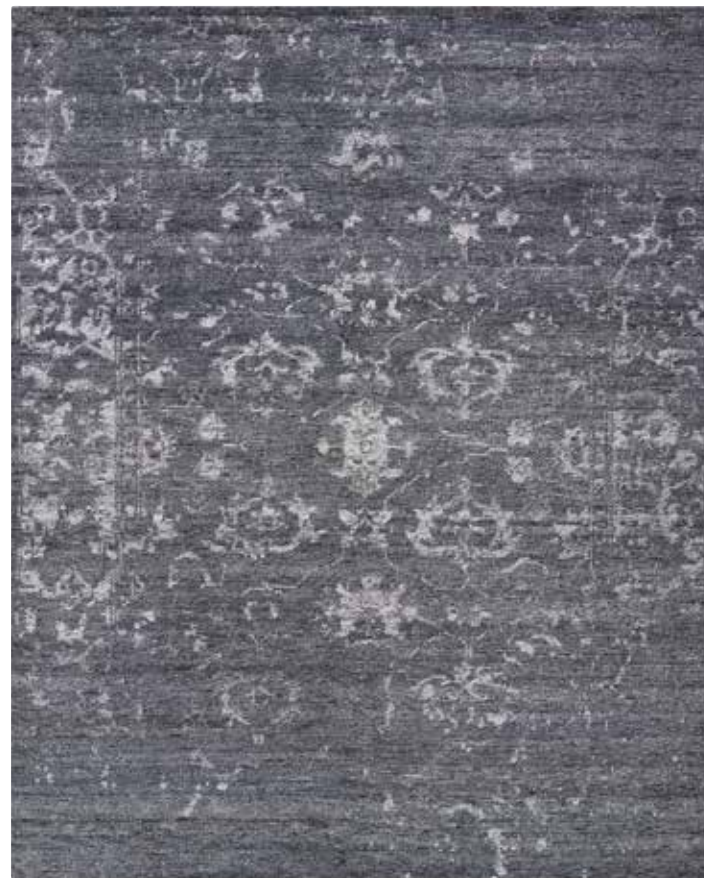
SHA15 BLUE STONE