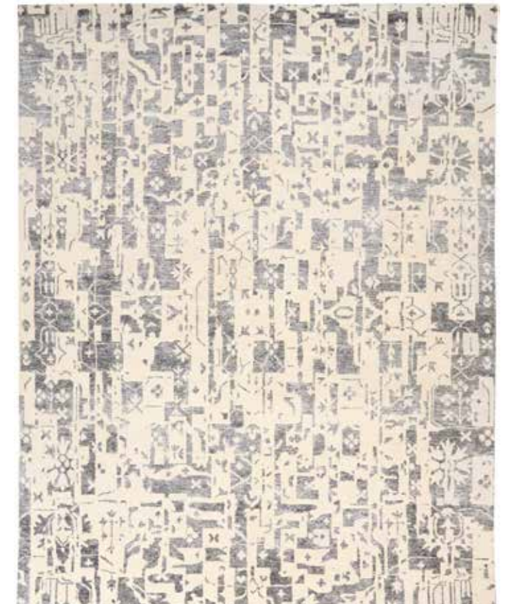
SHA19 IVORY GREY