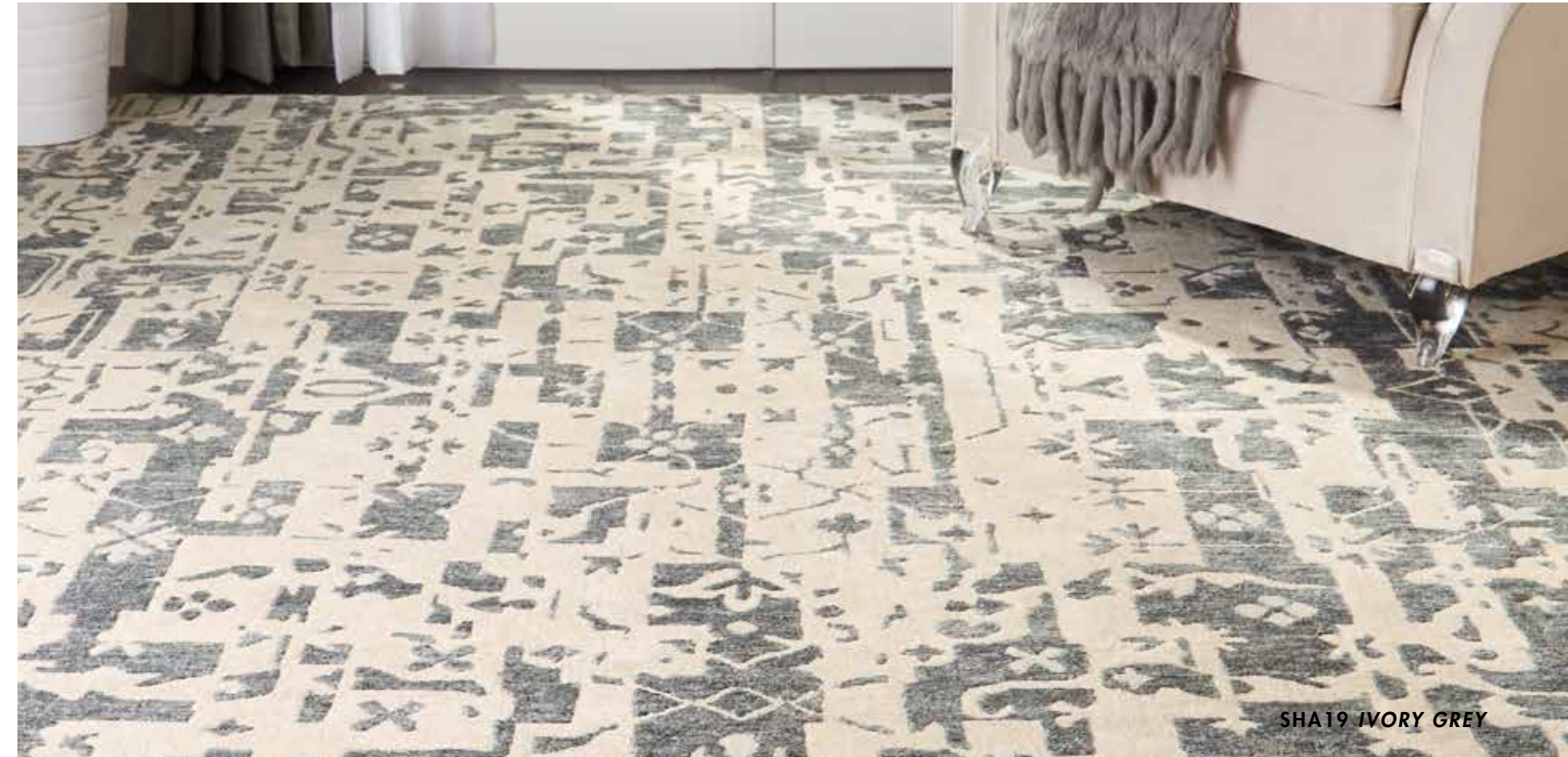
SHA19 IVORY GREY