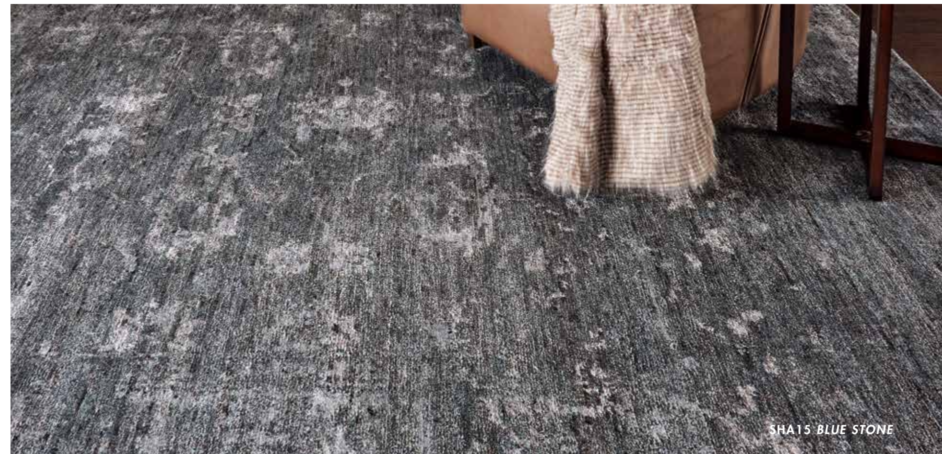
SHA15 BLUE STONE