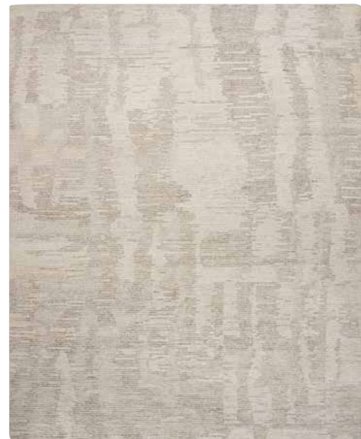
ELL01 IVORY GREY